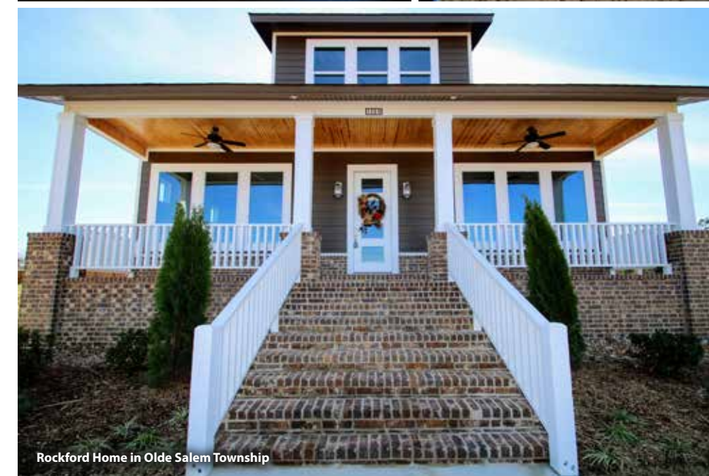
Rockford Home in Olde Salem Township