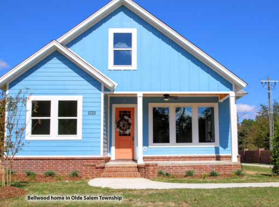
Bellewood home in Olde Salem Township