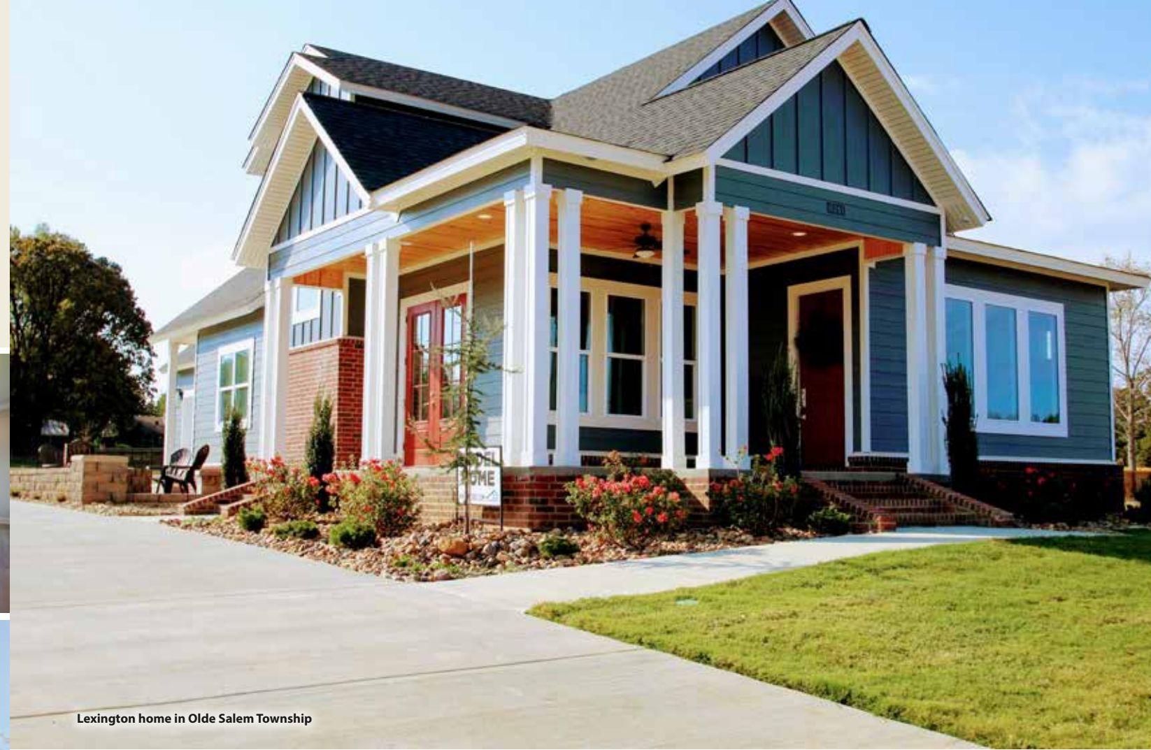
Lexington home in Olde Salem Township