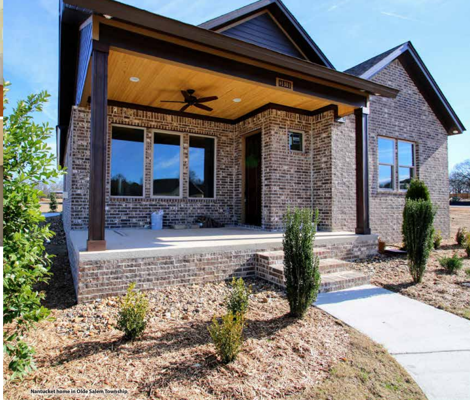
Nantucket home in Olde Salem Township